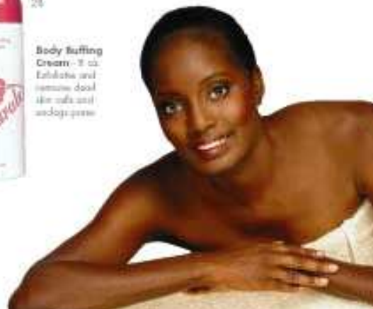
Body Buffing Cream - 8 oz. Exfoliates and removes dead skin cells and unclogs pores.