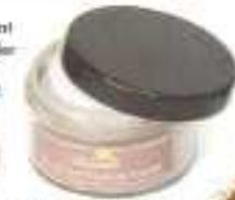
Medium Translucent Finishing Powder