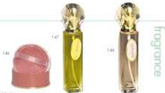
Elation A beautiful combination of floral and sensual blends. Elation Dusting Powder 3.25 oz.