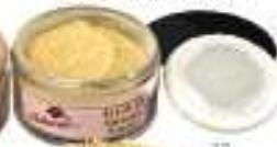
Gold Shimmer Powder