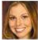
30L/30C Cameo Rose