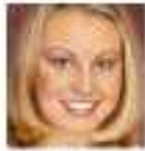
29L/29C Porcelain Rose