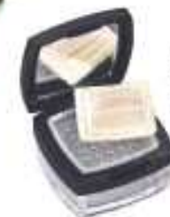
Loose Powder Compact