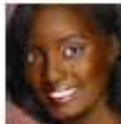
36L/36C Bamboo Orchid