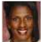
34L/34C Tiger Lily