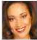
31L/31C Golden Daffodil