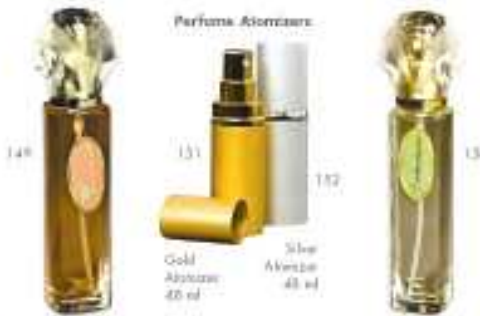
Divine Fragrance 50 ml A heavenly scent of fruity, spicy and powdery undertones.