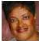
33L/33C Emerald Lily