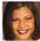
33L/33C Gilded Gofford