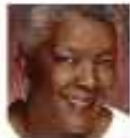
35L/35C Tropical Orchid