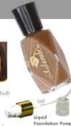
Liquid Foundation Pump